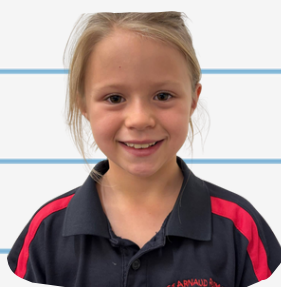
BAKERY BUCKS Madison