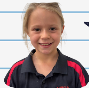
H & PE Madison