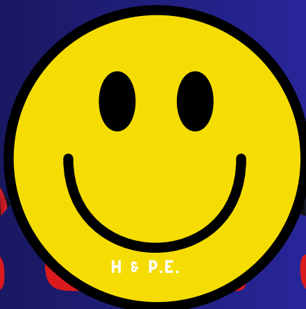
H & P.E.