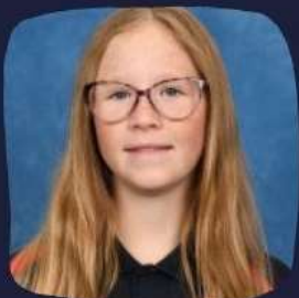
MUSIC INDI FISH