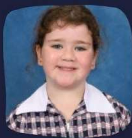
100% BAKERY BUCKS HARLOW NEWTON