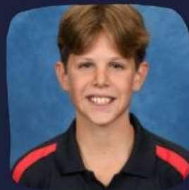
100% BAKERY BUCKS HARLOW NEWTON