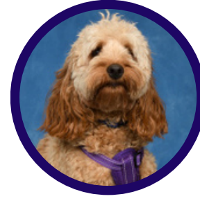
RUSTY Wellbeing Dog